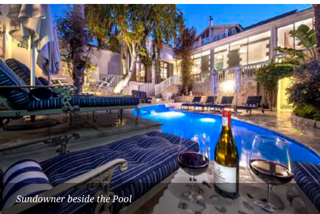
Sundowner beside the Pool