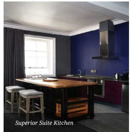
Superior Suite Kitchen