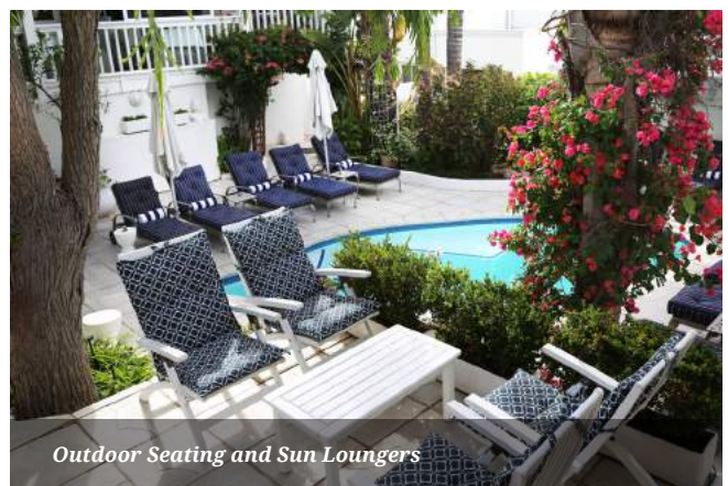
Outdoor Seating and Sun Loungers