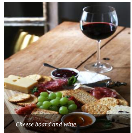
Cheese board and wine